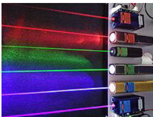
Photons in lazar beams