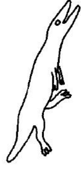
Rodhocetus (9.8 feet or 3 meters)